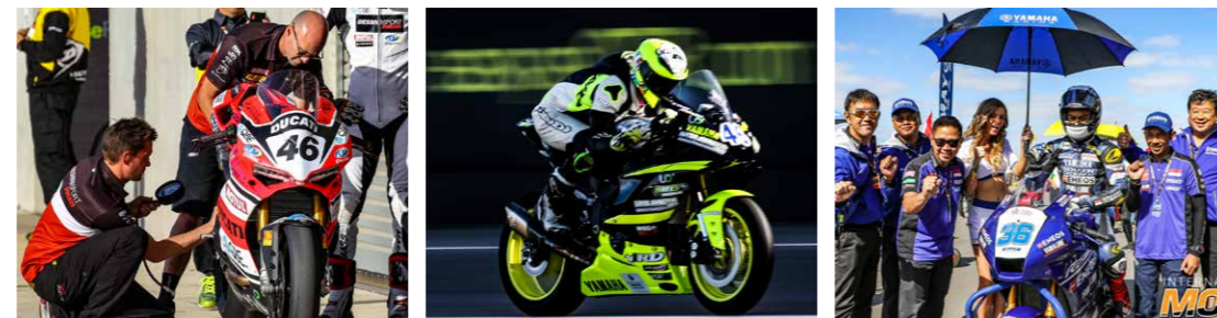
2020 INTERNATIONAL MOTOFEST | VIP HOSPITALITY