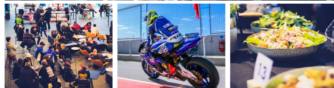
2020 INTERNATIONAL MOTOFEST | VIP HOSPITALITY